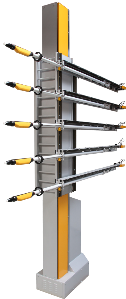
ZA13 with five gun axes UA04